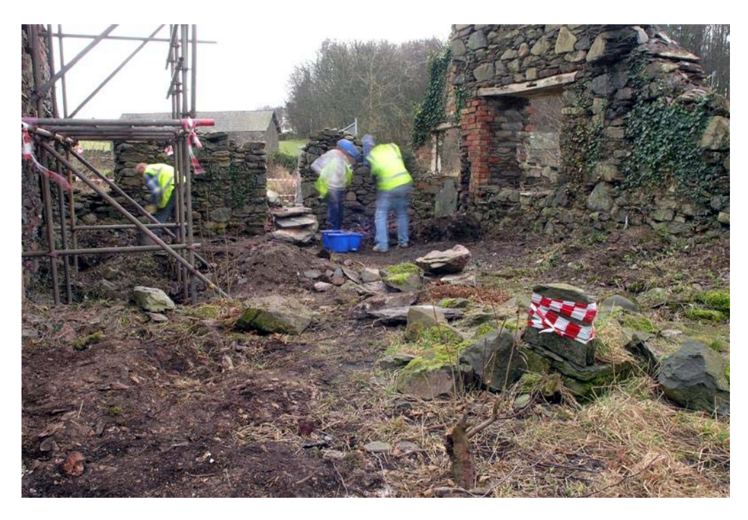
Plate 8: General view of Room 7 during clearance (facing east)