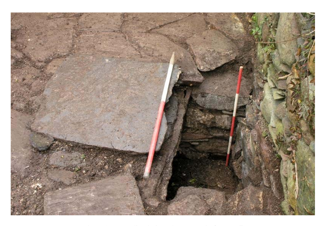
Plate 13: Stone-lined pit at the east end of Room 7