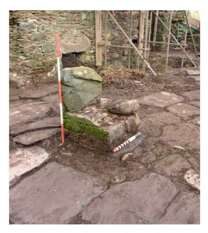
Plate 12: Possible pad stone within Room 7