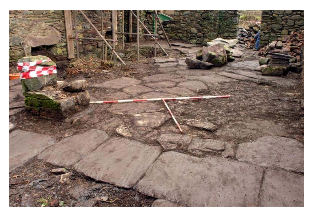
Plate 10: General view of Room 7 following clearance (facing east)