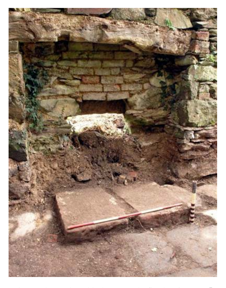
Plate 6: The two large blocks near to the fireplace in Room 5