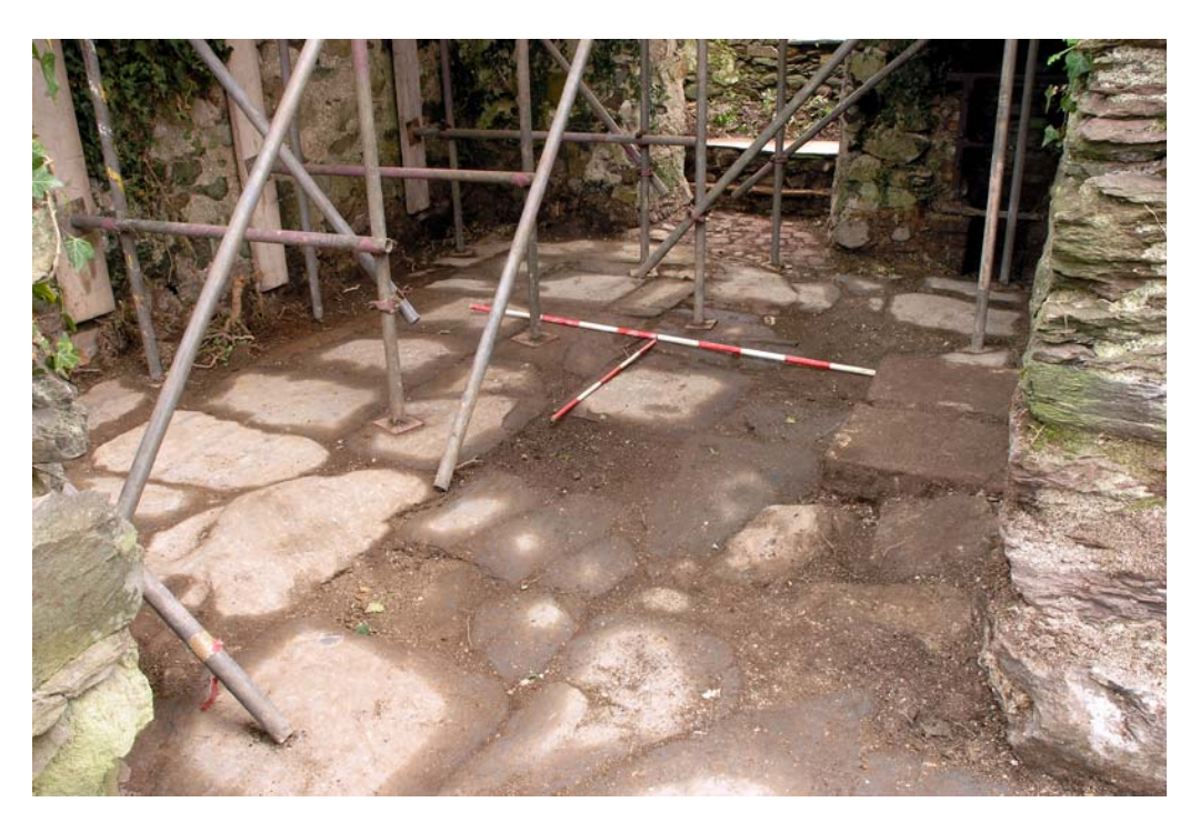
Plate 4: View of Room 5 following removal of overburden