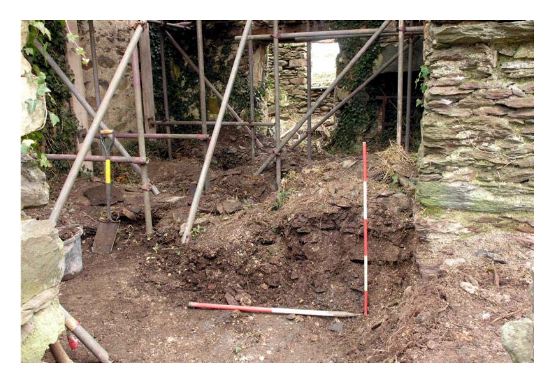
Plate 3: View of overburden in Room 5