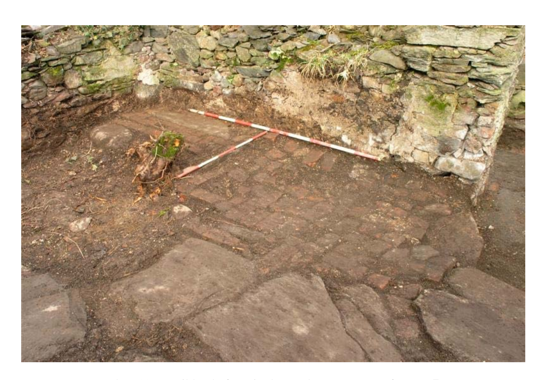
Plate 11: Possible platform in the north-west corner of Room 7