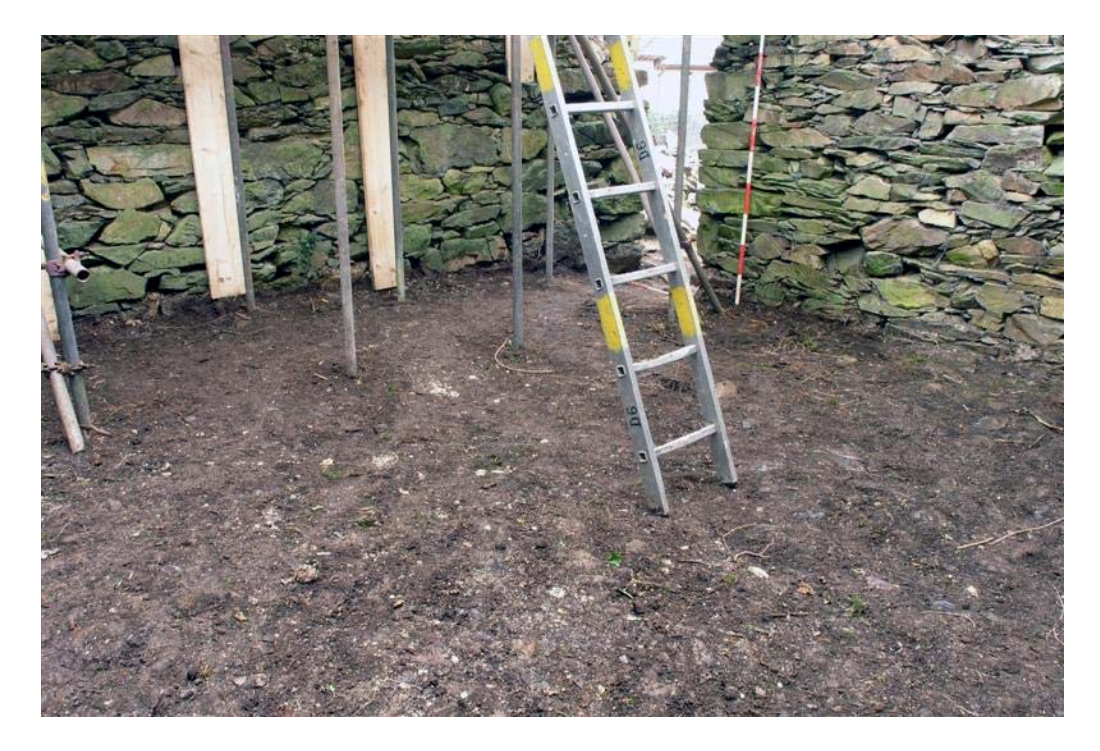
Plate 1: The floor in Room 4