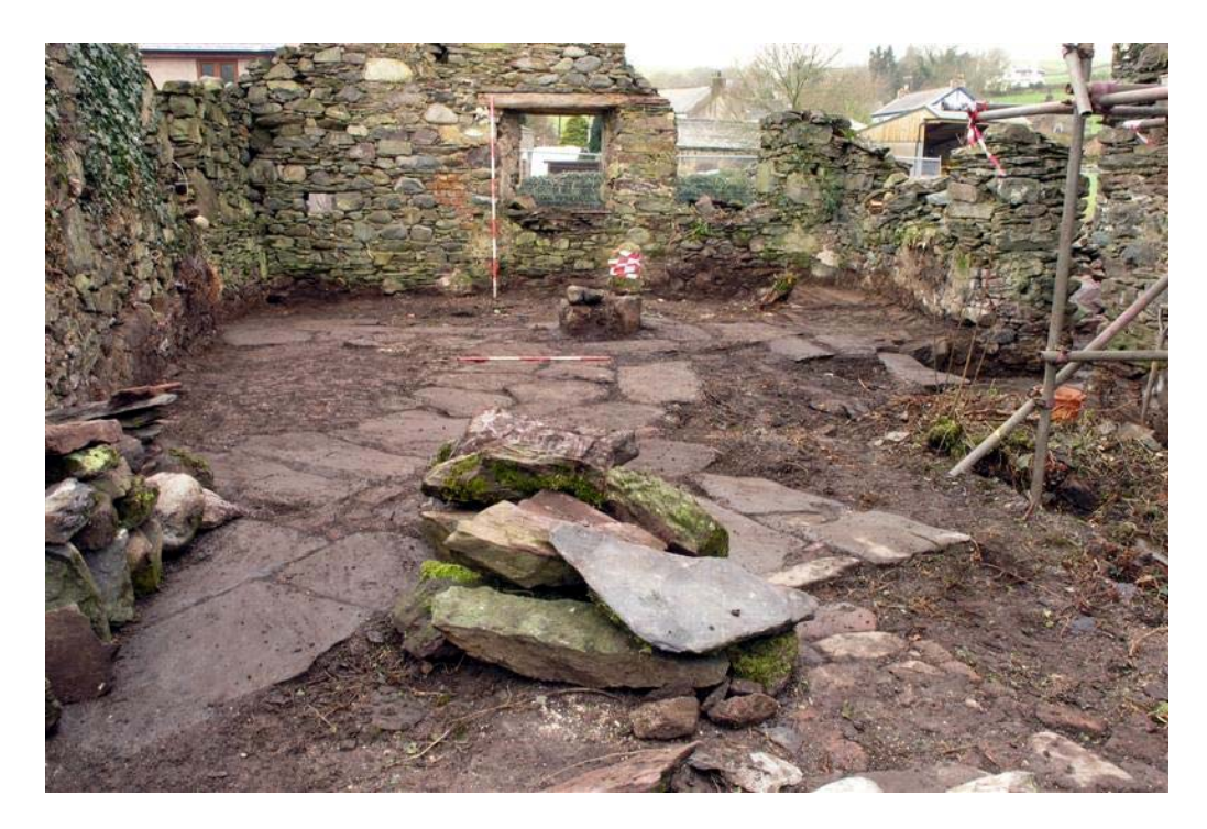
Plate 9: General view of Room 7 following clearance (facing west)