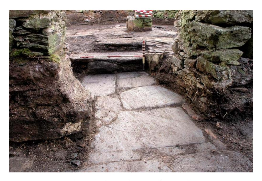
Plate 7: The doorway from Room {\bf 5} to Room {\bf 7}