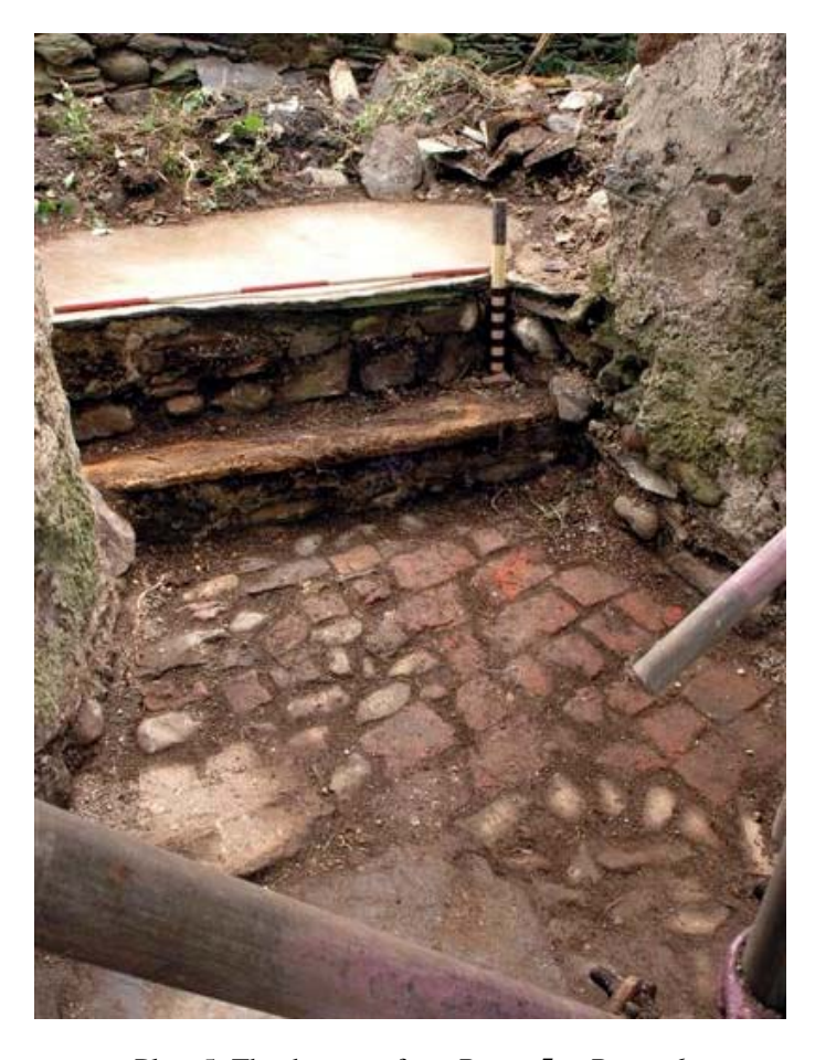
Plate 5: The doorway from Room \bf 5 to Room \bf 6