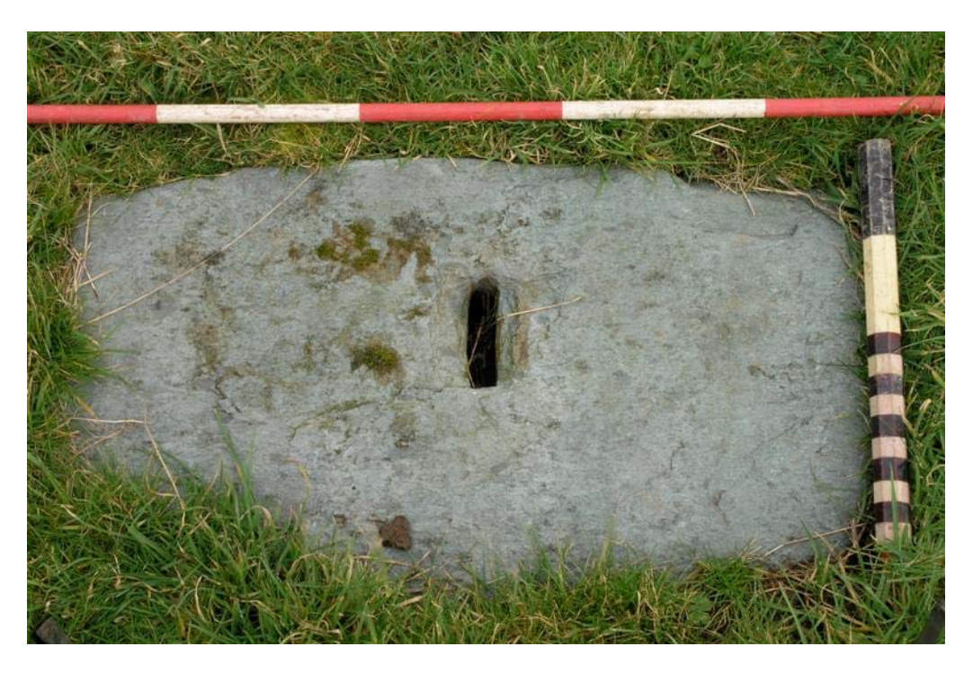
Plate 14: Example of Tenter Base