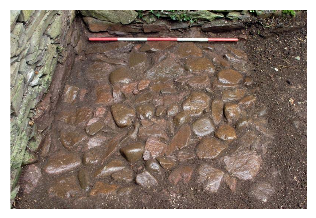
Plate 2: Detail of the floor in Room 4